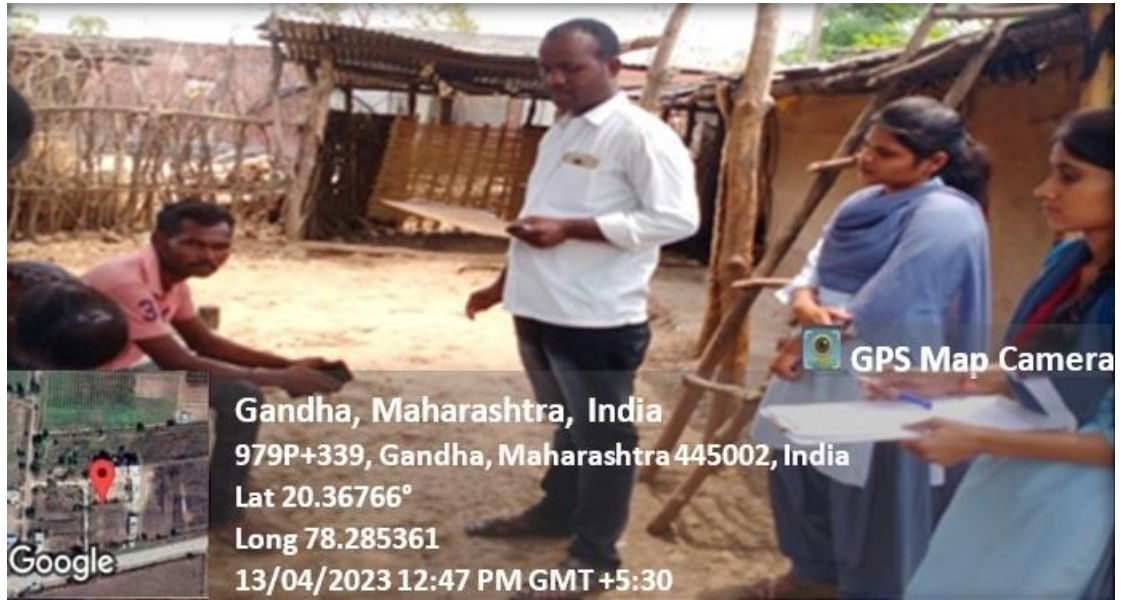
Field visit at Gandha Village